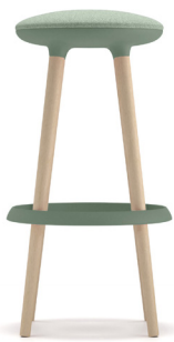
Dayton High Stool

Anthracite: Camira Blazer Silcoates CUZ3O