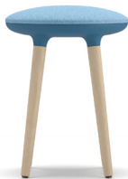
Dayton Low Stool