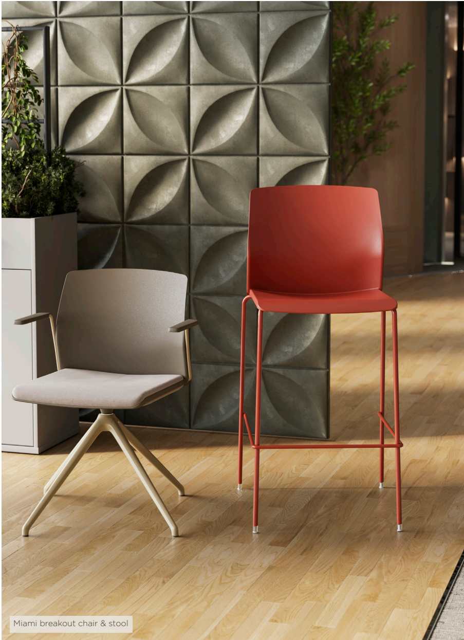
Miami breakout chair & stool