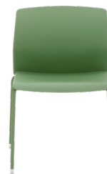
MIAMI 4 LEG