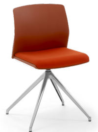
MIAMI 4 LEG STOOL